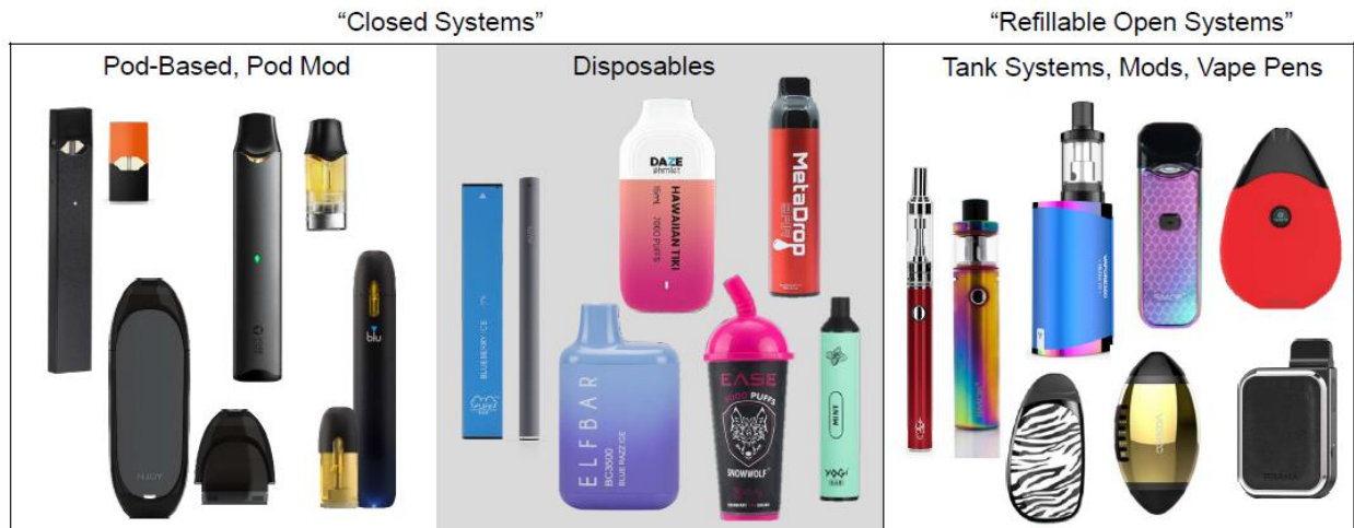
Sample of e-cigarette products. Images are not to scale.

The term “electronic cigarettes” covers a wide variety of products now on the market, from those that look like cigarettes, pens or USB drives to somewhat larger products like “personal vaporizers” and “tank systems.” Instead of burning tobacco, e-cigarettes most often use a battery-powered coil to turn a liquid solution into an aerosol that is inhaled by the user. The design of e-cigarette devices have changed since they have been introduced, becoming more sleek and more concealable.