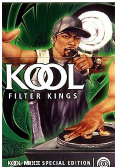
Kool Mixx cigarettes, 2004

Brown & Williamson used music as a way to target African Americans beginning in 1975 with the Kool Jazz Festival. In the 1980s, as part of the Kool Market Development Program, vans traveled through inner-city Houston to distribute free cigarette samples. The Kool City Jam, a free two-day concert, was also a part of this program. 29