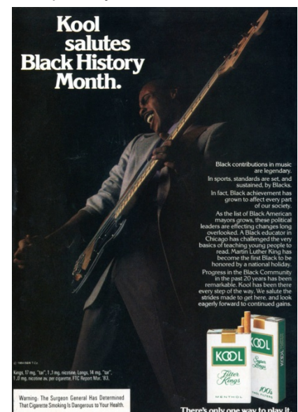
Kool advertisement, 1984

Industry documents reveal that as early as the 1950s, the tobacco industry has made concerted efforts to forge ties with the African American community in an effort to build a positive brand identity. Since the 1950s, Phillip Morris and Brown & Williamson have been engaged with the National Urban League, the National Association for the Advancement of Colored People (NAACP), and the United Negro College Fund, and have provided funding and organizational support to a laundry list of African American organizations. 30 In addition, the tobacco