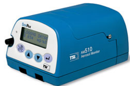
TSI SIDEPAK AM510 PERSONAL AEROSOL MONITOR

A TSI SidePak AM510 Personal Aerosol Monitor (TSI, Inc., St. Paul, MN) was used to sample and record the levels of respirable suspended particles in the air. The SidePak uses a built-in sampling pump to draw air through the device where the particulate matter in the air scatters the light from a laser. This portable light-scattering aerosol monitor was fitted with a 2.5 µm impactor in order to measure the concentration of particulate matter with a mass-median aerodynamic diameter less than or equal to 2.5 µm, or PM 2.5 . Tobacco smoke particles are almost exclusively less than 2.5 µm with a mass-median diameter of 0.2 µm.[9] The Sidepak was used with a calibration factor setting of 0.32, suitable for secondhand smoke.[10, 11] In