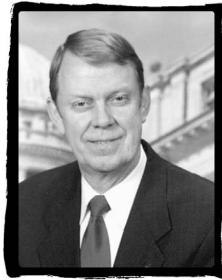
Senator Mike Chaney