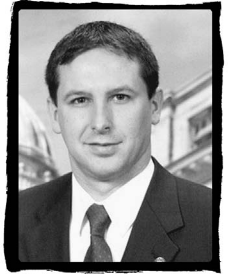
Senator Shannon Walley