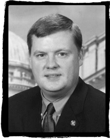
Senator Sid Albritton