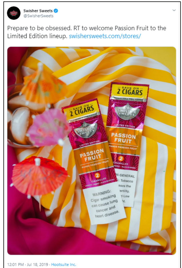
Figure 1: Swisher Sweets (@SwisherSweets), TWITTER (July 18, 2019, 12:01 PM), https://twitter.com/SwisherSweets/status/1151884758089117697 .

https://trade.swisher.com/purple-swish/ (last accessed Nov. 9, 2021); Swisher Sweets (@SwisherSweets), TWITTER (July 18, 2019, 12:01 PM), https://twitter.com/SwisherSweets/status/1151884758089117697 (Passion Fruit); Swisher Sweets (@SwisherSweets), TWITTER (Aug. 4, 2018, 5:00 PM), https://twitter.com/SwisherSweets/status/1025894282803273730 (Coco Blue); Swisher Sweets (@SwisherSweets), TWITTER (Feb. 6, 2018, 6:18 AM), https://twitter.com/SwisherSweets/status/960880462506938369 (Maui Pineapple).