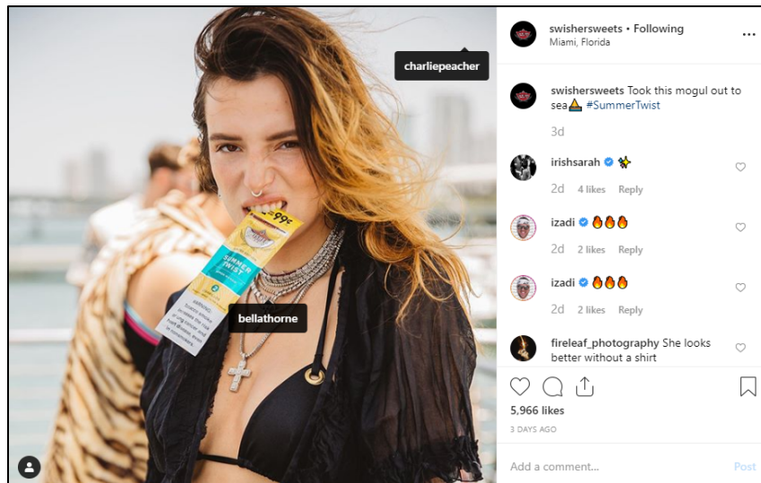
Figure 4: Swisher Sweets (@swishersweets), INSTAGRAM (June 22, 2019), https://www.instagram.com/p/By-60bEnU53/ (last accessed June 22, 2019).

The price for Swisher products also varies among neighborhoods in a manner that encourages youth consumption. A study analyzing 2013 data from California found that Swisher Sweets cost significantly less in census tracts with higher proportions of school-aged youth and young adults. 26 Moreover, a survey of cigar advertisements at 530 California retailers selling tobacco near middle and high schools (median distance of 0.35 miles) found that one in five cigar ads were for Swisher Sweets. 27