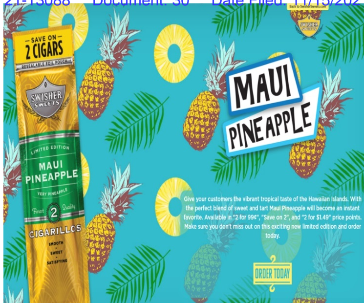
Figure 3: Maui Pineapple , SWISHER SWEETS, http://trade.swishersweets.com/maui-pineapple/ (last accessed Feb. 27, 2018).

Swisher has also targeted youth through event sponsorship, pricing practices, and advertising. In June 2019, for example, the company hosted the Swisher Sweets Summer Twist Yacht Party, an event featuring celebrities popular among youth and young adults. 23 The party attendees included former Disney Channel actress Bella Thorne, Chanel West Coast from MTV’s Ridiculousness and Justina Valentine from MTV’s Wild N Out . 24 Swisher also operates a so-called “Artist Project,” in which it promotes its brand at concerts, sponsors musical artists, and holds pop-up music events in convenience stores that are promoted on its website and social media. 25